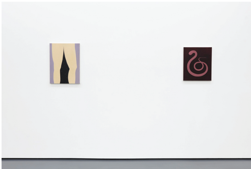
Alice Tippet, 'Woman on Yellow Motorcycle in Crystal Lake', 2017, exhibition view, Kimmerich, Berlin

orange human figure poses in a uniform taupe ground. The work mimics the odalisque tropes of 19th-century French painting. In contrast to the contoured bodies of Jean-Auguste-Dominique Ingres or Henri Matisse, however, this figure is a crisply delineated silhouette. A tiny dark triangle floats on its folded legs, near the figure's knees: a short-hand for the pubic region that recurs in other paintings on view. It's the figure's head that sticks in mind, though: turned away from the viewer, its long black hair is striated with green highlights. The pose evokes a subtle parody of figure painting's traditionally misogynistic attitude to the female nude.