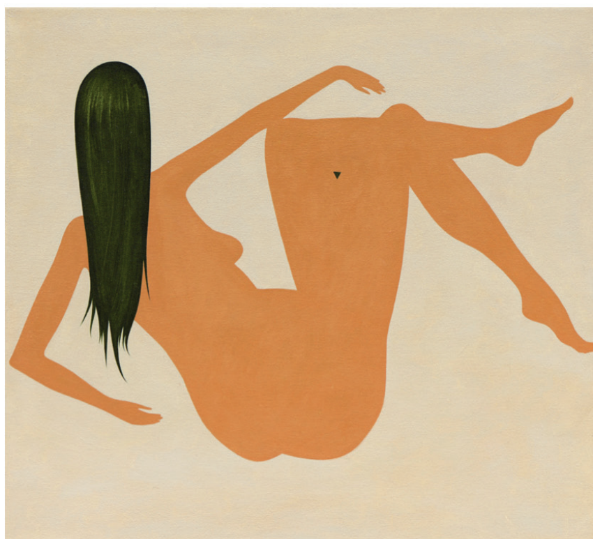
Alice Tippit, Stroke , 2016, oil on canvas, 46 x 51 cm.

images, bodies and objects become cryptic silhouettes. Often, the paintings deliver an elusive erotic charge. In Lure (2016), for example, stars glow in the hollow between two milky greige legs. Mauve-coloured negative space pushes in on these limbs, while the inky firmament tapers upward, stopping just shy of the picture's top edge, and the unidentified character's genitalia.